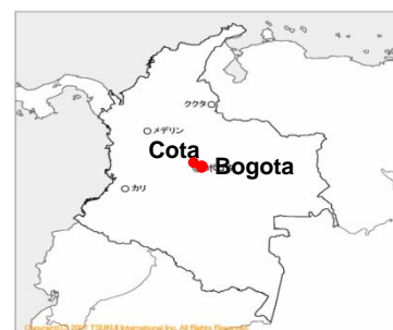
<Map of headquarters and branch locations>

Business lines: Various import, export, and offshore trading of goods and services in the metal, machinery, electronics, automotive, energy and chemical, and food sectors (current as of the end of October 2008).