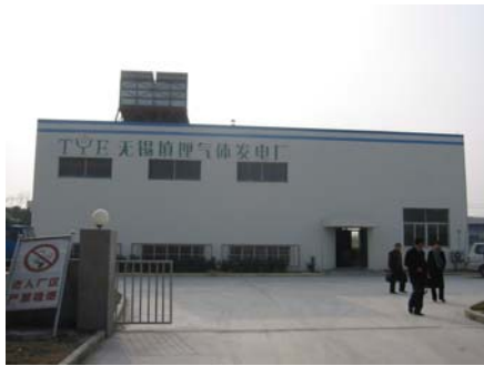
Photo 1: Wuxi Tianshun Environmental Technology Co. Ltd. (external view)